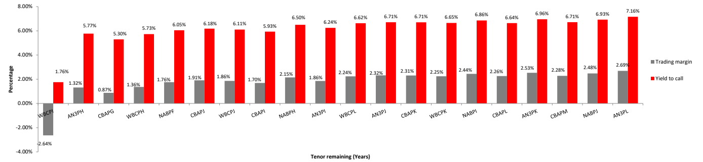
Major Bank Trading Margins and Yields to Call (Yield vs Tenor Remaining)

Some data is sourced from ASX and Refinitiv Eikon.